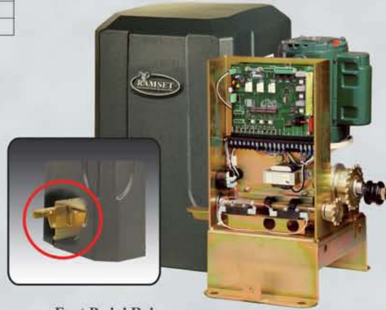
Foot Pedal Release

Emergency Release: This mechanism disengages the gate from the operator to allow easy manual opening and closing of the gate during power outages and emergencies.