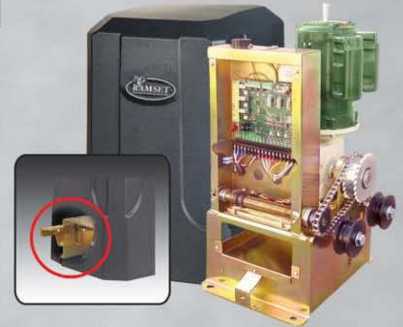
Foot Pedal Release

Emergency Release: This mechanism disengages the gate from the operator to allow easy manual opening and closing of the gate during power outages and emergencies.