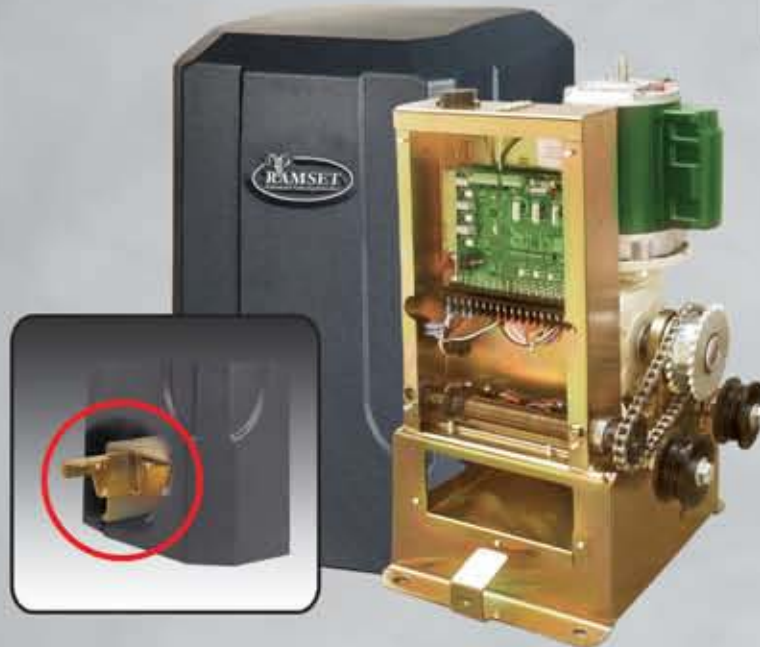
Foot Pedal Release

Emergency Release: This mechanism disengages the gate from the operator to allow easy manual opening and closing of the gate during power outages and emergencies.