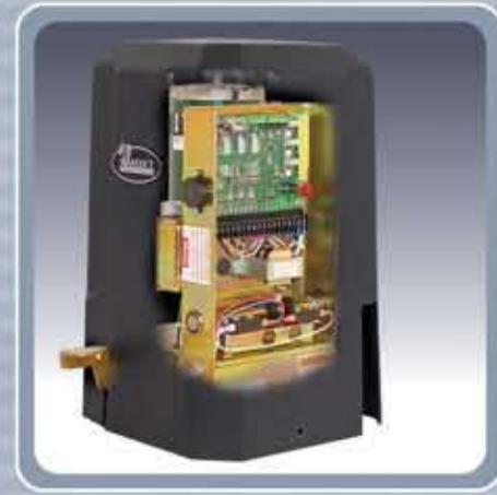
RAM 100 Residential Commercial