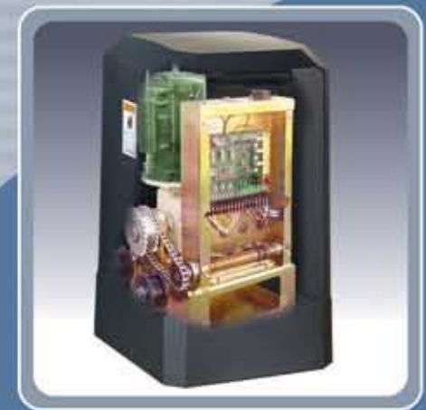
RAM 5500 Commercial Industrial

Designed to satisfy the need for gate operators in high traffic areas, such as residential gated communities, public storages, industrial parks and government facilities.