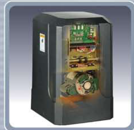
RAM 5000 Commercial Industrial