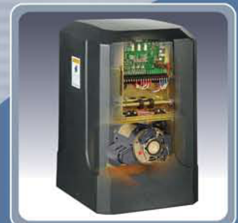
RAM 5200 Commercial Industrial