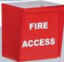
RAMSET Fire Box

Allows the fire department to open your gate in the case of an emergency.