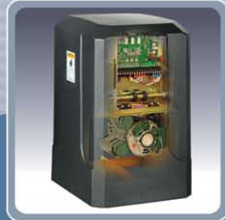
RAM 5100 Commercial Industrial