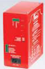
RAMSET BBS-Battery Back-Up System

A safety device that stops the gate from closing on a vehicle.