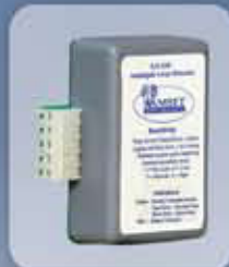
RAMSET ILD-24S Loop Detector

A safety device that stops the gate from closing on a vehicle.