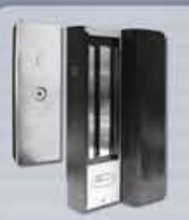
RAMSET Magnetic Lock

Allows the fire department to open your gate in the case of an emergency.