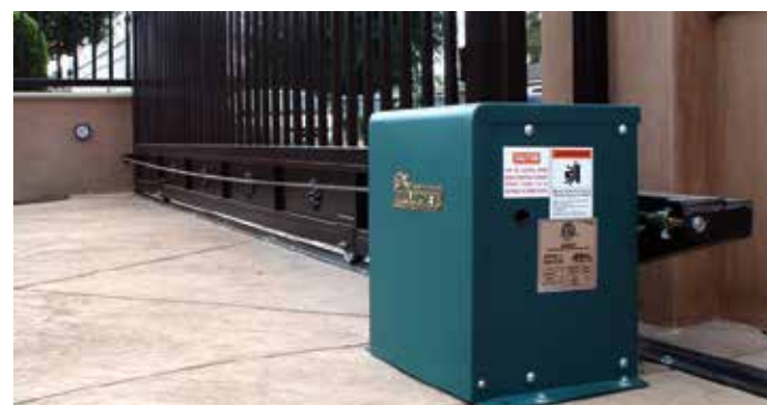
Ram 50 & Ram 30 for Economical Slide & Swing Gate Operation