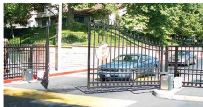
Ram 100, 1000 & Ram 300 Slide & Swing Gate Operation