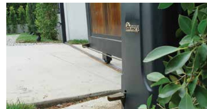
Four Models with Unique Foot-Pedal Manual Release