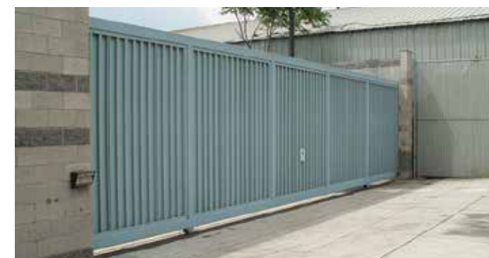
Ram 5000 Series Slide Gates to 65' & 5000 lbs Ram 3000 Series Swing Gates to 20' & 3000 lbs Ram 2000 Series Overhead Gates to 20' & 700 lbs